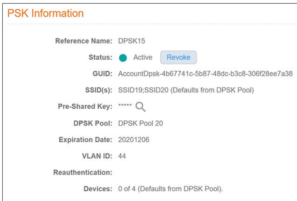
FIGURE 2 DPSK15 Information in UI After API PUT Call

You can go to the UI to confirm that the DPSK was edited correctly. The values should match those in the Response body from the PUT. For example, you can see that the SSID list no longer has any restrictions, and that the VLAN ID has been changed to 44.